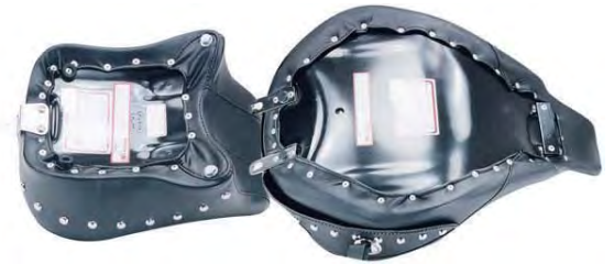
1991-1996 baseplates shown

Solo and rear seats baseplates are constructed of marine-grade fiberglass. Solo seats have two chromed mounting tabs that align with the stock threaded fender mounts. Rear seat mounts vary with model and year.