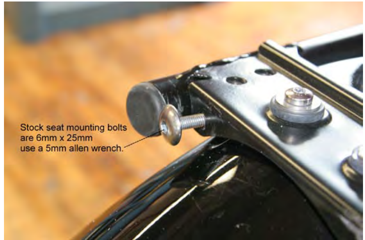
Triumph Bonneville T-100 2013 pictured