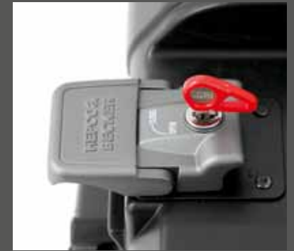
Stable metal mounting lock, standar