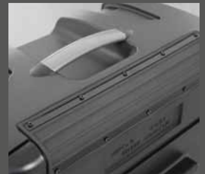
Integrated ergonomic carrying handle and rubber hinge cover