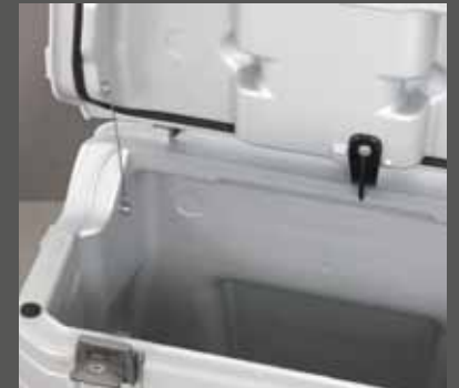
Wire lid rod and lid holder, standar