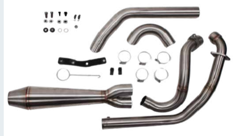
*Muffler image for reference, all items apply to all muffler styles

NEVER dyno test your bike with carbon fiber or titanium canisters installed - the intense heat and lack of cooling air can quickly burn through the canister material. Two Brothers Racing does not provide a warranty for burned canisters.