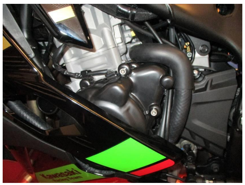
THIS KIT CONTAINS THE ITEMS PICTURED AND LABELLED OVER PAGE.

SOME PARTS MAY BE SHOWN FOR CLARITY OF INSTRUCTIONS ONLY.