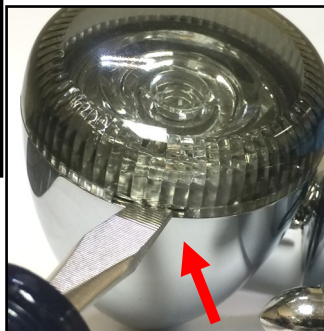
Remove Lens at the slot

Note: Custom Dynamics® smoked or clear motorcycle turn signal lens (sold separately) required for proper installation. OEM lenses are not compatible.