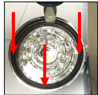
Gently pry around the perimeter