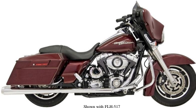
Shown with FLH-517

CAUTION: WRAPPING of Pipe with Heat Tape may adversely affect the pipe & will Void Warranty!