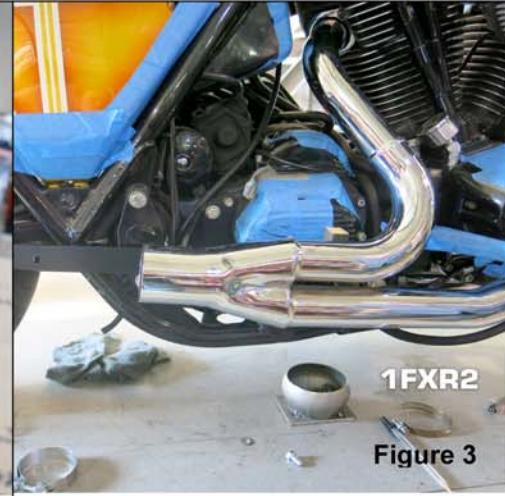
1FXR2 Figure 3