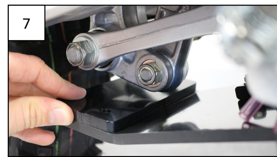
TFHC 6x25mm + washers + em6f Put the reinforced plate in place Mettre la plaque de renfort en place