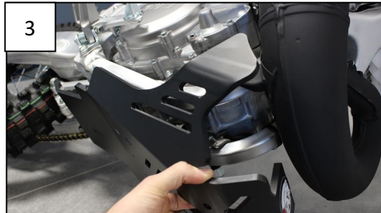
Put the skid plate in place Insérer le sabot sur la poutre AR