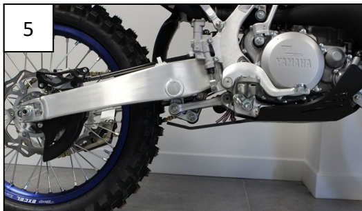
Put back the bike straight Remettre la moto droite