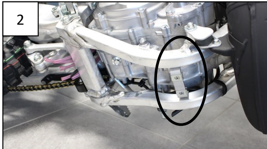
PM02-01-013 + Clamped Bolts