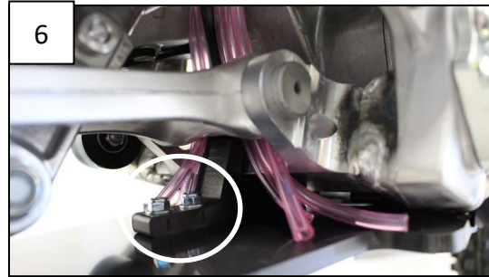
PM01-04-161 + TFHC 6x25mm + washers + em6f Put the rear plastic mount in place Mettre le contre crochet en place